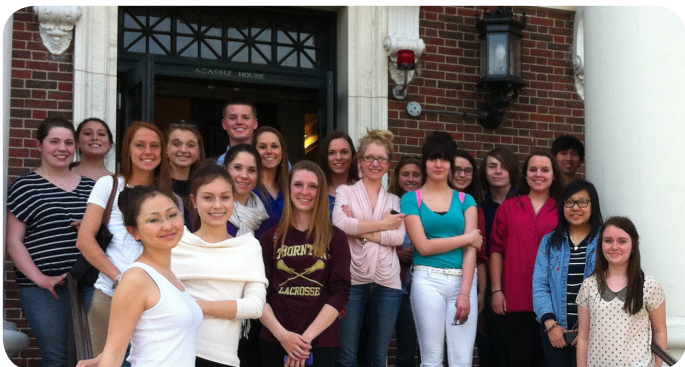
Enjoy visits to Harvard & other college campuses.

The Director of International College Counseling and the International College Counselor have more than 50 years of experience in college counseling and have sent more than 5,000 high school students to college during their careers.