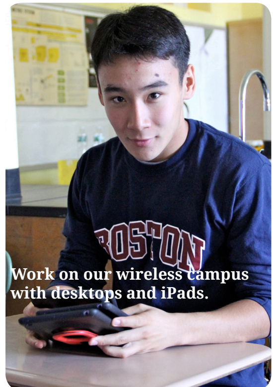
Work on our wireless campus with desktops and iPads.

This school is authorized under Federal law to enroll nonimmigrant students.