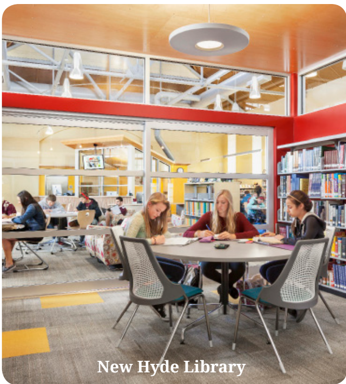
New Hyde Library

Thornton Academy is committed to challenging every student to reach his or her fullest academic potential by providing a wide array of rigorous courses. Additional elective classes, independent study opportunities, and special interest courses that meet after school offer students the ability to excel far beyond a standard curriculum.