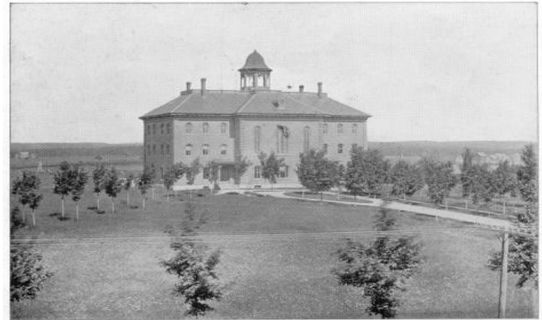
MAINE CENTRAL INSTITUTE, Main Street.